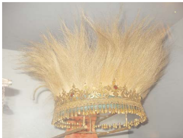
Ethiopian crown trimmed with lion fur: Horniman Museum, London

Predators are a big attraction for tourists: Two of the “big five” – lions, leopards, elephants, buffalo, and rhinoceros – are predators. 70% of people travelling to Kenya for a holiday are visiting to see wildlife. In 1981, it was estimated that an individual lion in Amboseli National Park earned Kenya $515,000 in foreign exchange income. If more of this money ends up improving the well-being of people who suffer from livestock predation, then it could offset the costs or allow them to afford improved protection.