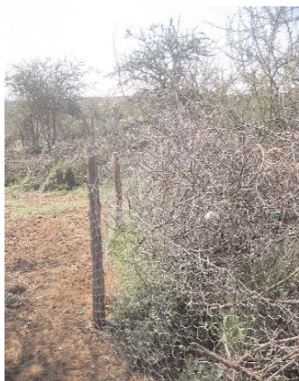
Thorny fenced boma in Laikipia, Kenya