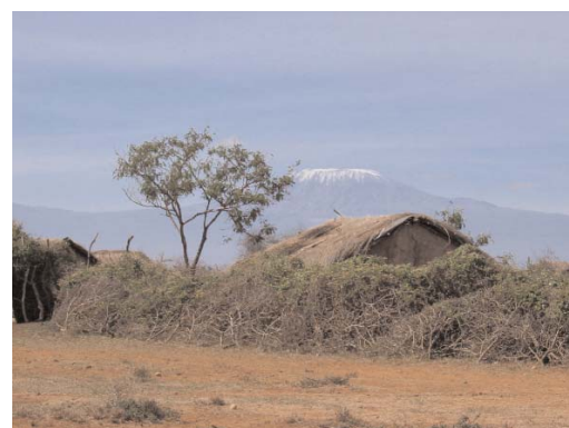
Living boma near houses, Chyulu, Kenya