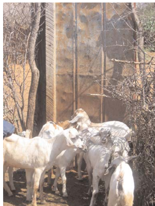
Boma Door, Laikipia, Kenya

More than 600 years ago, the Tonga people living under the Nyanga district of what is now Eastern Zimbabwe used pit circles to keep their livestock safe at night. The stone-lined pits, dug into the slope with a wall enclosing the lower side, were about 4 metres deep. The depth protected animals from being lifted or stampeded out of the pit. Livestock entered the pits through a low tunnel, walled and roofed with flat stones. The tunnels were usually curved, so that a predator looking in would not be able to see where it led. People slept in houses built above the tunnel, from which they controlled poles to keep the tunnel open or closed. Any movement of the poles, or noise, would alert them to livestock thieves or predators.